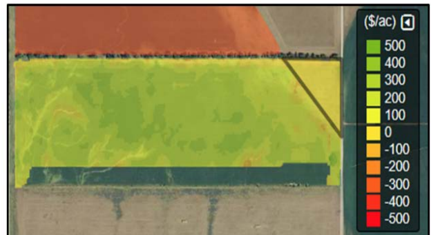
After: 2018 + Forage Production

Average Yield: 62.6 bushels/acre Profit: $147.98/acre ROI: 58.2%